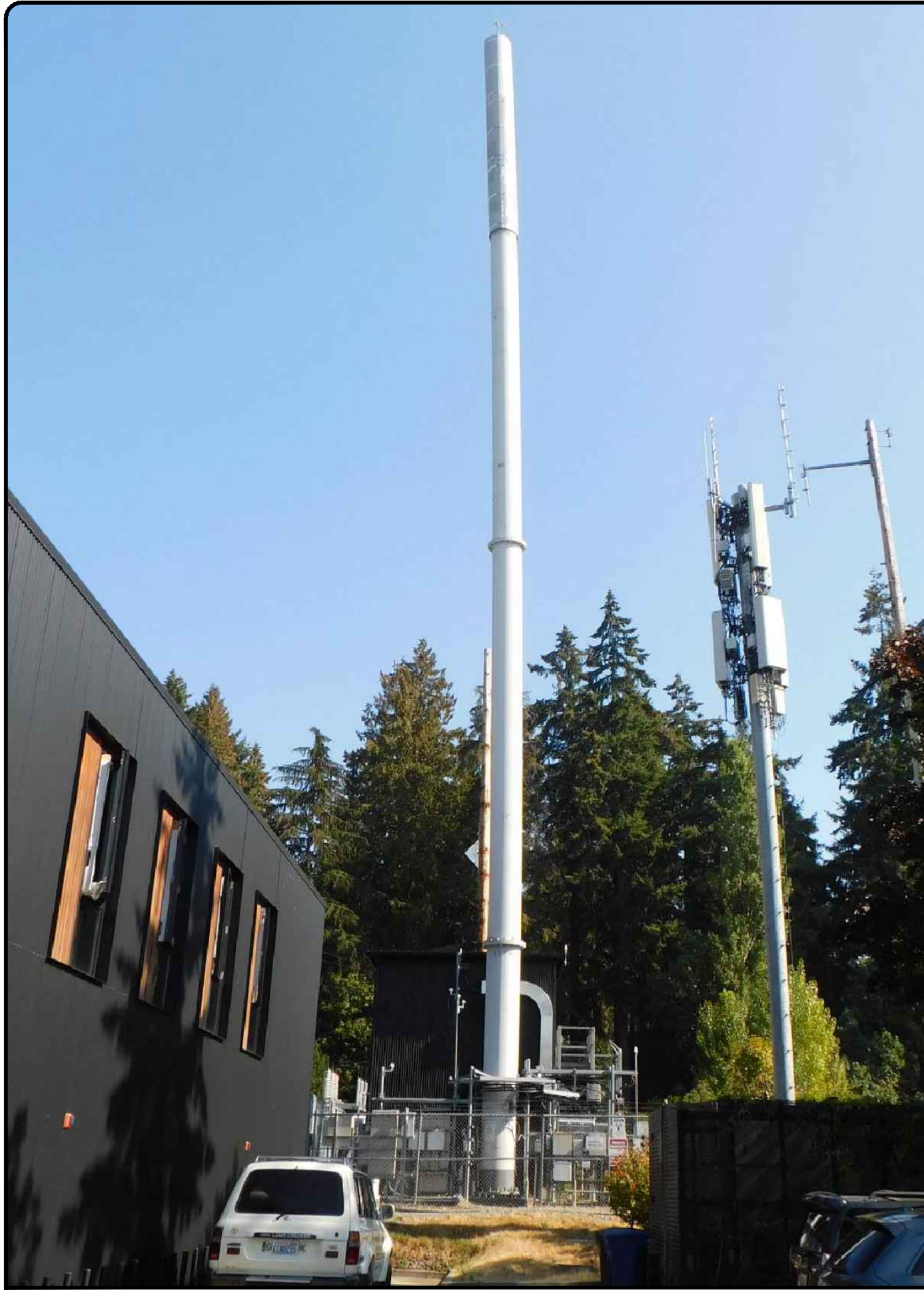
1 EXISTING OVERALL TOWER SCALE: NOT TO SCALE