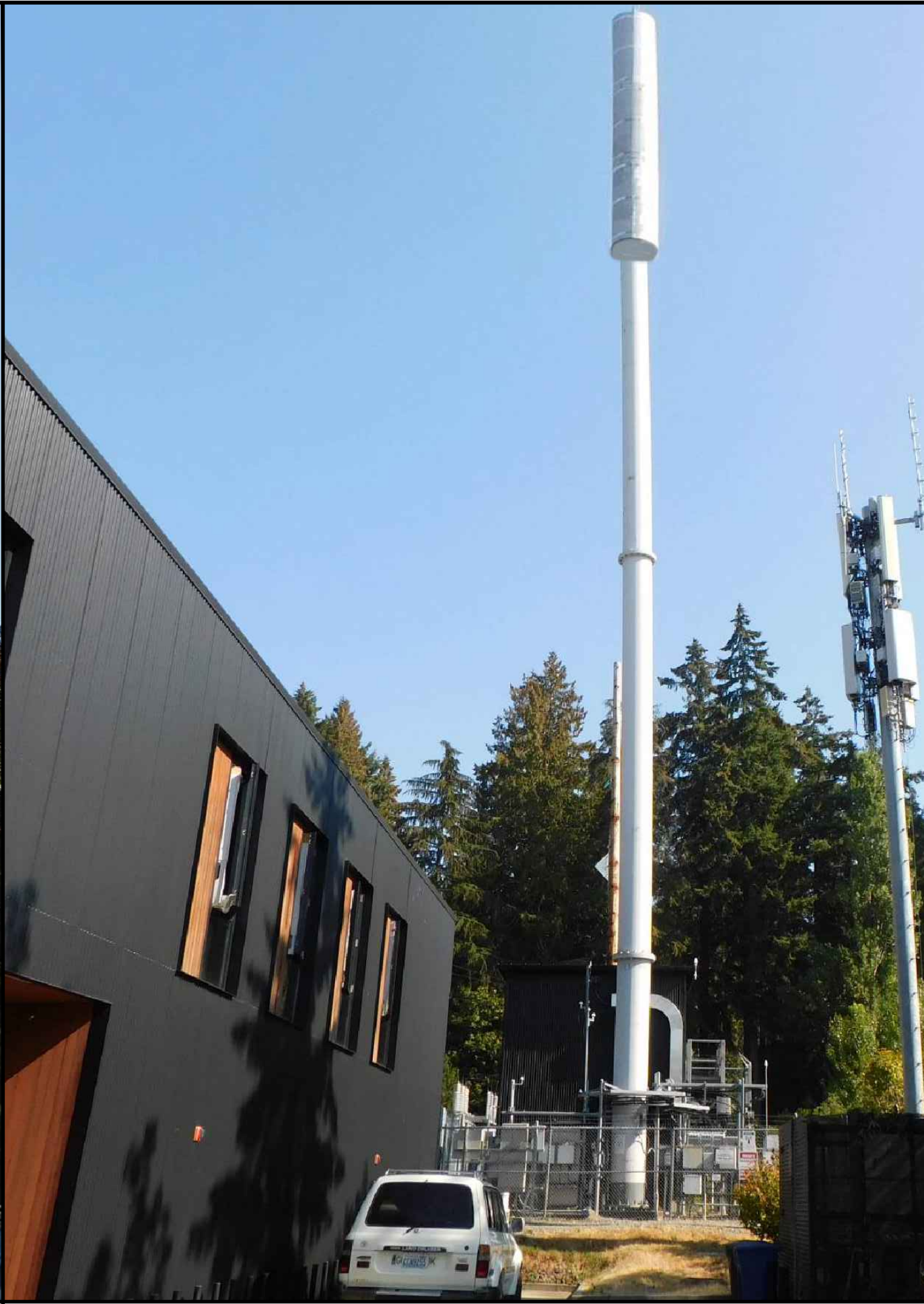
2 FINAL OVERALL TOWER SCALE: NOT TO SCALE